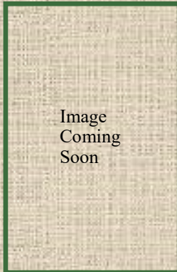
TBC Site Supervisor